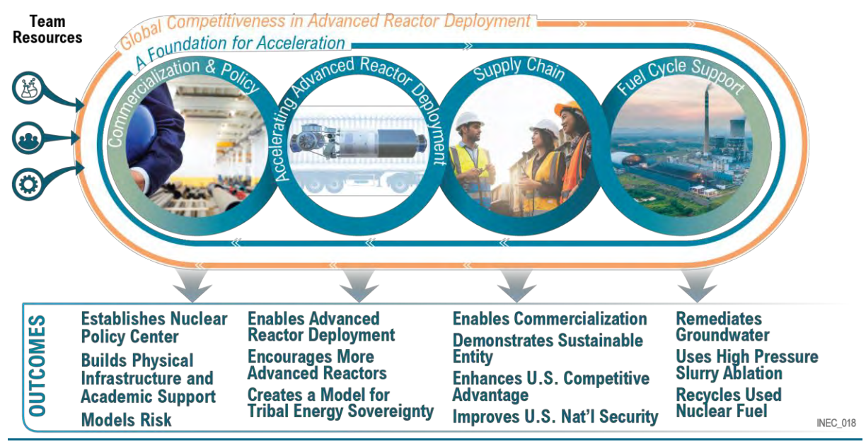
Figure 1-1: Overarching Vision. The INEC Tech Hub proposes highly integrated Component Projects developed to create the conditions for the establishment of America's advanced nuclear infrastructure.

The vision of the INEC Tech Hub is to enable the growth of the nation's advanced nuclear reactor deployments by identifying policy gaps and informing new regulations, growing a newly skilled workforce, building capabilities for a domestic supply chain, and supporting efforts to advance the domestic